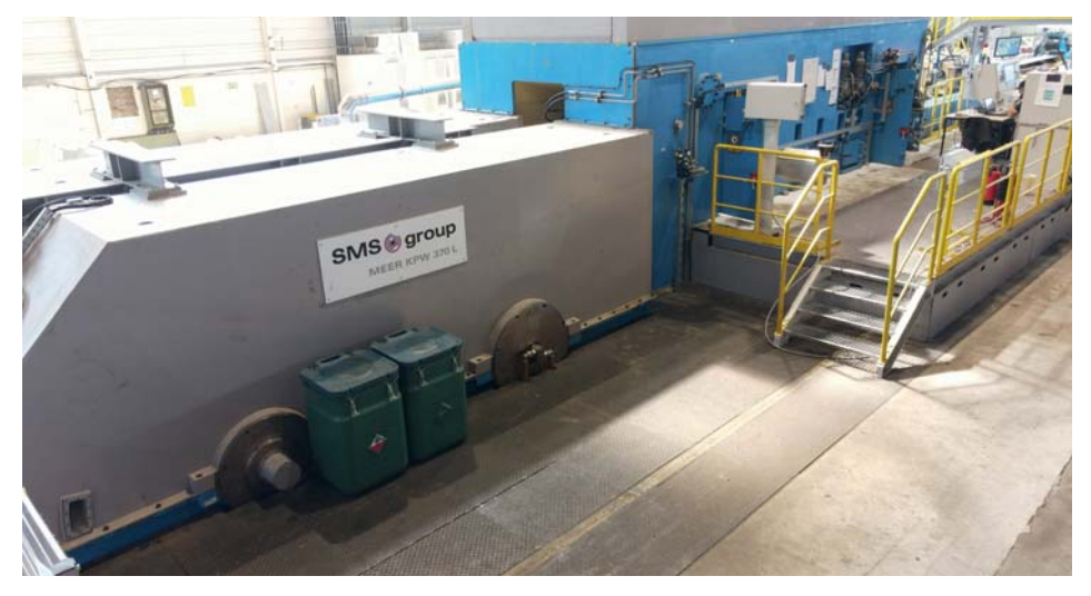
The addition of a cold pilger mill for large diameter tubes at the Remscheid, Germany plant has increased both capacity and capabilities.

"We see good potential for CoEx tubes. The technology was developed