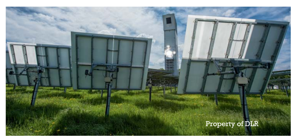
MST is developing high-performance tubes to replace the nickel alloy welded tubes currently used in solar salt receivers.

MST is a proven supplier of superheater tubes for corrosion critical applications, from standard and optimised grades such as DMV 347HFG (1.4908; UNS S34710) to the more specialised DMV 310N (1.4952; UNS S31042) and DMV AC66 (UNS S33224/ EN 1.4877). DMV AC66 was developed primarily for use in waste-to-energy plants and is today the 'standard' material for those and biomass plants.